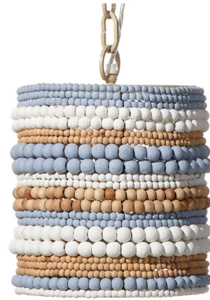
Shown in blue / off white

This easygoing, lighthearted look is created from dozens of hand-carved mango wood beads. Each bead is placed by hand. These pendants evoke ocean breezes and tropical destinations, and are a wonderful way to create an at home oasis for your friends and family.