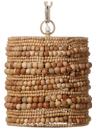
Shown in natural / off white

This easygoing, lighthearted look is created from dozens of hand-carved mango wood beads. Each bead is placed by hand. These pendants evoke ocean breezes and tropical destinations, and are a wonderful way to create an at home oasis for your friends and family.