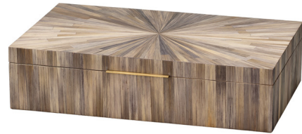
Shown in antique brass / gray

Artisans create the exuberant starbursts on these Palm Marquetry Box from thin strips of straw in variegated natural tones. Each opens easily on a quadrant hinge to reveal a generous interior lined with chambray fabric. Underneath is a brown suede lining.