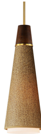
Shown in natural aged brass / grasscloth

A stained grasscloth shade is stitched with corresponding laces and suspended from solid wood housings trimmed with Natural Aged Brass in the Sumatra Pendant. The combination of finishes and materials makes for a rich interpretation of the Coastal lighting trend and transports you to an island getaway wherever they are installed.