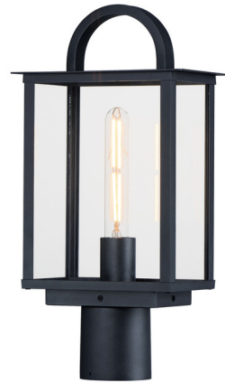
Shown in black / clear

The Manchester Outdoor Pier/ Post Light is inspired by the classic coach lantern that has been modified with simplified embellishments. The black frame has been modified with a squared arc handle surrounded by Clear glass panels. Note: Post sold separately.