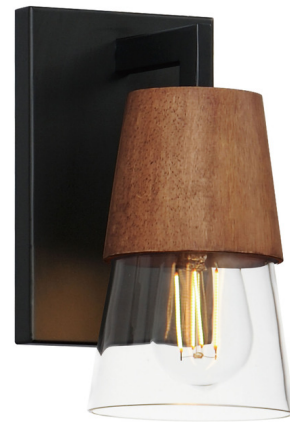
Shown in black / walnut / clear

Capped by wood finished in Walnut, the Carpenter Wall Sconce features conical Clear Glass shades. Contrasting Matte Black frames of squared tubing add clean geometry to the design. Can be installed up or down.