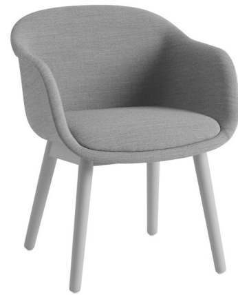
Shown in grey / remix 133

The Fiber Conference Armchair with Wood Base is an innovative approach to an iconic look. The conference version of this stunning armchair features a deeper seat than the standard version and a fixed seat cushion for increased comfort during prolonged periods of sitting. The chair's shell seat is supported by four wooden legs for a warm, natural touch.