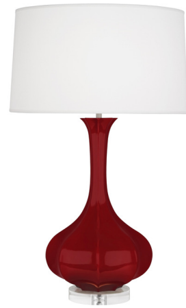
Shown in sangria / pearl dupioni

The Pike Table Lamp adds a clean decorative look to your interior space. The curved ceramic body rests on lucite or aged brass base and is topped with a hardback drum shaped fabric shade that casts warm light across your room. Full range dimmer switch is located on the lamp socket.