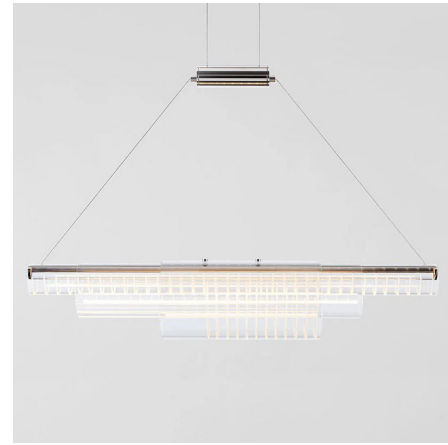
Shown in polished nickel / clear

The Coax Linear Pendant features an array of nested clear glass tubes for a serene expression that appears to float weightlessly in the air. An integrated LED strip illuminates etching in the tubes to create a dazzling display that will attract attention over a counter or dining table.