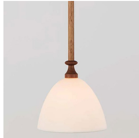
Shown in white oak / bone china

COLOR RENDERING . . . . . 90 CRI LAMP COLOR . . . . . 2700K LUMENS/WATT . . . . . 62.50 LUMINOUS FLUX . . . . . 500 lumens