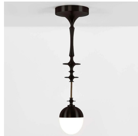
Shown in oil rubbed bronze / opal

PRODUCT DIMENSIONS . . . . . Canopy: 6" diameter LAMP LIFE . . . . . 50000 hours COLOR RENDERING . . . . . 90 CRI LAMP COLOR . . . . . 2700K LUMENS/WATT . . . . . 56.25 LUMINOUS FLUX . . . . . 450 lumens