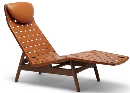
Shown in walnut / cognac shoulder leather

The AV Egoist Chaise Longue was originally designed in the early 1950s by Danish designer Arne Vodder, but only a few pieces were manufactured at the time. Sibast Furniture, with the help of Vodder's son Michael, have reintroduced this underappreciated gem for the current day based on photographs and Vodder's original sketches. The AV Egoist Chaise Longue features the hallmarks of mid-century Danish Modern design with its molded wood veneer frame, solid wood legs and woven leather seat. The chaise's bold, angular silhouette is contrasted by the rich texture of natural materials for a warm, inviting expression.