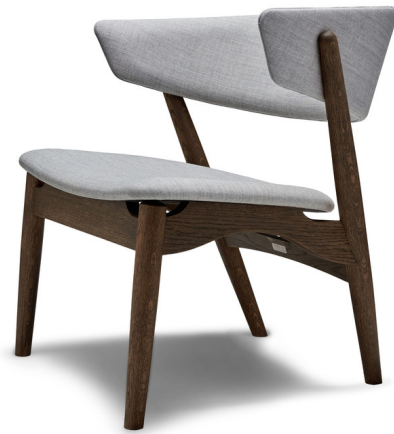
Shown in smoked oak / remix light grey

PRODUCT DIMENSIONS . . . . . Seat Height: 13.8"