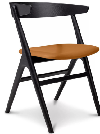
Shown in black oak / saga cognac leather

PRODUCT DIMENSIONS . . . . . Seat Height: 17.7"