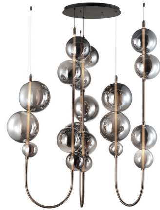
Shown in black chrome / mirror smoke

PRODUCT DIMENSIONS . . . . . Canopy: 20"W x 19"D LAMP LIFE . . . . . 20000 hours COLOR RENDERING . . . . . 90 CRI LAMP COLOR . . . . . 3000K LUMENS/WATT . . . . . 120.00 LUMINOUS FLUX . . . . . 2160 lumens