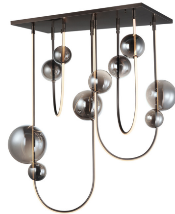
Shown in black chrome / mirror smoke