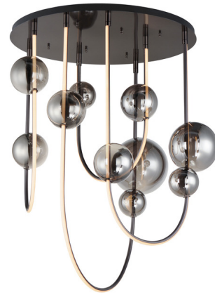
Shown in black chrome / mirror smoke

PRODUCT DIMENSIONS . . . . . Canopy: 30"D LAMP LIFE . . . . . 20000 hours COLOR RENDERING . . . . . 90 CRI LAMP COLOR . . . . . 3000K LUMENS/WATT . . . . . 160.00 LUMINOUS FLUX . . . . . 3040 lumens