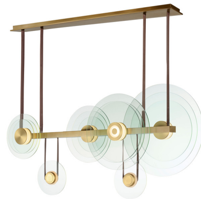
Shown in natural aged brass / clear

LAMP LIFE . . . . . 20000 hours COLOR RENDERING . . . . . 90 CRI LAMP COLOR . . . . . 3000K LUMENS/WATT . . . . . 240.00 LUMINOUS FLUX . . . . . 2400 lumens