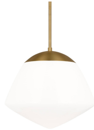
Shown in burnished brass / milk

PRODUCT DIMENSIONS . . . . . Downloads: One 6" and Four 12" Included