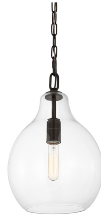
Shown in aged iron / clear

PRODUCT DIMENSIONS . . . . . Adjustable Chain Length: 60"