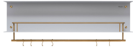
Shown in brass / stone

The Hanger Shelf is a contemporary storage solution that will bring an industrial aesthetic to your space. It features a laser cut sheet Aluminum, press bent and powder coated and complemented by a hand polished metal guard rail and pan rail. Fixing screws are not supplied. Brass: Made from precision-machined solid brass and finished with two layers of durable satin lacquer. This finish will age slowly, moving from radiant brass to deeper and golden within a few years.