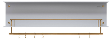
Shown in brass / stone

The Hanger Shelf is a contemporary storage solution that will bring an industrial aesthetic to your space. It features a laser cut sheet Aluminum, press bent and powder coated and complemented by a hand polished metal guard rail and pan rail. Fixing screws are not supplied. Brass: Made from precision-machined solid brass and finished with two layers of durable satin lacquer. This finish will age slowly, moving from radiant brass to deeper and golden within a few years.