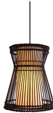
Shown in brown / brown