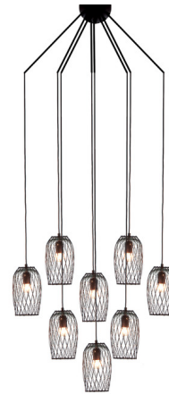
Shown in black / clear

PRODUCT DIMENSIONS . . . . . Canopy: 6" Dia. x 4"H