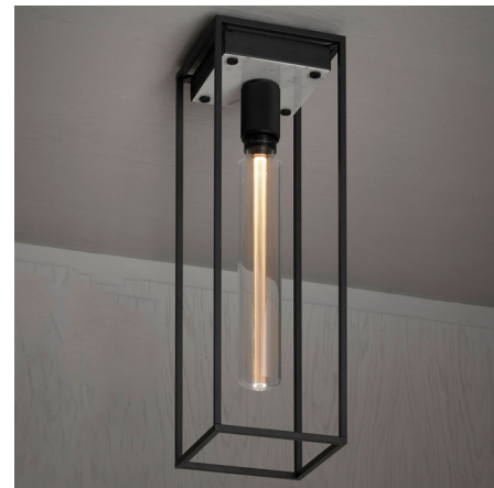
Shown in satin black / white marble

The Caged Ceiling Light brings an open airy feel with an industrial vibe to your space. Finished with a Matte Black cage and complemented by a White or Black Marble backplate, cross knurled, lamp holder and our signature coin screws. This piece can work on its own or in linear procession for maximum impact.