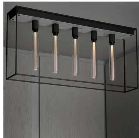
Shown in satin black / white marble

The Caged 5.0 Ceiling Light brings an open airy feel with an industrial vibe to your space. Finished with a Matte Black cage and complemented by a White or Black Marble backplate, cross knurled, lamp holder and signature coin screws. This piece can work on its own or in linear procession for maximum impact.