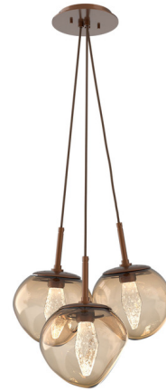
Shown in burnished bronze / bronze geo

The Luna Cluster Pendant adds a decorative beauty to your interior space. The individual pendants feature organic shaped artisan cast glass diffusers with inner led shapes casting warm shadows across your room. Each piece is a unique work of art.