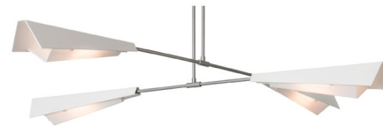
Shown in vintage platinum / white

The Vertex Pendant is inspired by an origami crane, with its sharp folds and graceful beauty. The dual stems holds slim arms with White Art glass diffuser and steel V shaped colored shades. Sloped ceiling adaptable one way to 45 degrees. Choose a Finish for the canopy, stems and fixture arms and choose a Color for the metal shades. Handmade to order by skilled artisans in Vermont, USA. Lifetime limited warranty.