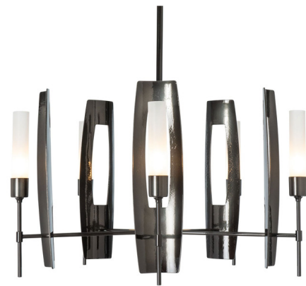
Shown in ink / frosted