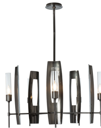
Shown in ink / clear

The Passage Pendant brings a clean elegance to your interior space. Each textured, hand-forged curved backplate, with a vertical cut out, creates a stunning play of light and shadows across your room from the cylindrical glass diffuser. Sloped ceiling adaptable to 45 degrees. Lifetime Limited Warranty when installed in residential setting. Handmade to order by skilled artisans in Vermont, USA.