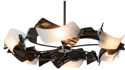
Shown in dark smoke / frosted

PRODUCT DIMENSIONS . . . . . Downrods: One 3", One 6", and Three 12" Included