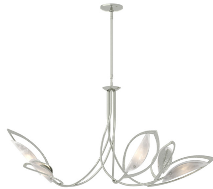
Shown in sterling / frosted

The Aerial Pendant achieves a harmonious blend of materials that evoke an outdoor ambiance. Steel elements resembling leaves are enhanced by art glass, which is shaped through heating and draping over contoured structures. The fixture's asymmetrical and organic design fosters a botanical aesthetic. Sloped ceiling adaptable to 45 degrees. Handmade to order by skilled artisans in Vermont, USA. Lifetime limited warranty.