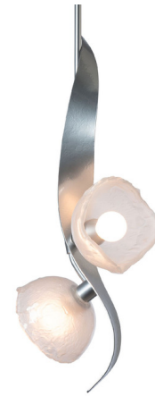
Shown in sterling / frosted

PRODUCT DIMENSIONS . . . . . Max Adjustable Overall Height: 30.6" - 75.6"