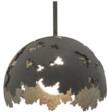
Shown in natural iron

The Pangea Pendant brings a nature inspired design with brutalist aesthetics to your interior space. Hand forged plates collide and merge together to create a unique opened half globe, casting warm shadows of light across your room. Sloped ceiling adaptable one way to 45 degrees. Handmade to order by skilled artisans in Vermont, USA. Lifetime limited warranty. Note: To create a multi-light option, purchase 3 pendants and use Hubbardton Forge's round or linear canopy, sold separately below, to create your own unique look.