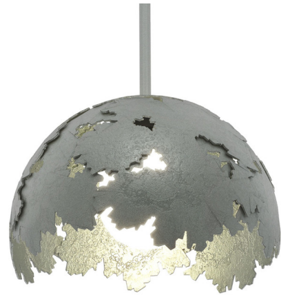
Shown in vintage platinum

The Pangea Pendant brings a nature inspired design with brutalist aesthetics to your interior space. Hand forged plates collide and merge together to create a unique opened half globe, casting warm shadows of light across your room. Sloped ceiling adaptable one way to 45 degrees. Handmade to order by skilled artisans in Vermont, USA. Lifetime limited warranty. Note: To create a multi-light option, purchase 3 pendants and use Hubbardton Forge's round or linear canopy, sold separately below, to create your own unique look.