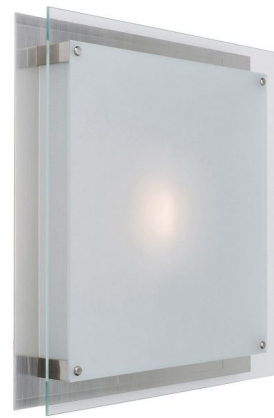
Shown in brushed steel / frosted

Vision Square Wall / Ceiling Mount features a frosted glass shade with a brushed steel finish. Available in three sizes with two lamping options. ADA Compliant. ETL listed for damp locations. Suitable for commercial or residential use.