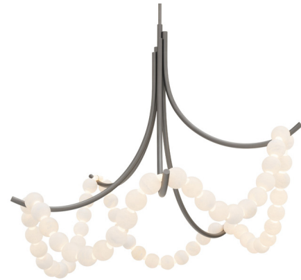
Shown in antique nickel / alabaster