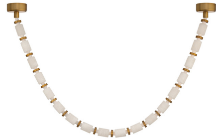
Shown in aged brass / alabaster