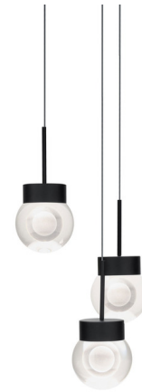
Shown in black / etched glass

LAMP LIFE . . . . . 55000 hours COLOR RENDERING . . . . . 90 CRI LAMP COLOR . . . . . 3000K LUMENS/WATT . . . . . 230.38 LUMINOUS FLUX . . . . . 1221 lumens