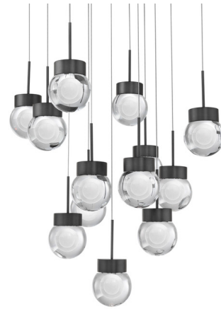
Shown in black / etched glass