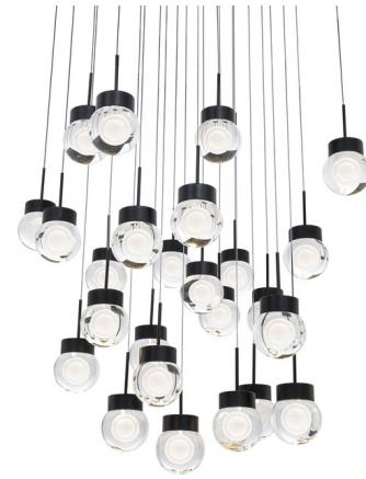
Shown in black / etched glass