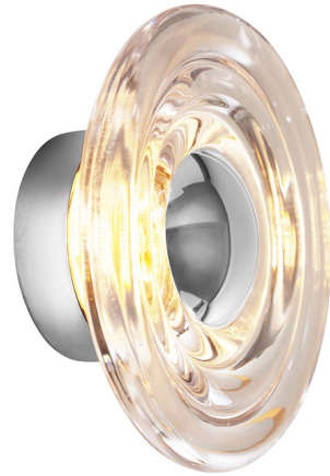
Shown in silver / clear

PRODUCT DIMENSIONS . . . . . Canopy: 4.7" diameter COLOR RENDERING . . . . . 90 CRI LAMP COLOR . . . . . 2700K LUMENS/WATT . . . . . 106.67 LUMINOUS FLUX . . . . . 800 lumens