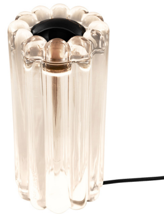
Shown in clear

COLOR RENDERING 90 CRI LAMP COLOR 2700K LUMENS/WATT 106.67 LUMINOUS FLUX 800 lumens