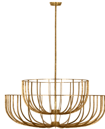
Shown in polished antique brass