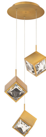
Shown in aged brass / crystal

LAMP LIFE . . . . . 50000 hours COLOR RENDERING . . . . . 90 CRI LAMP COLOR . . . . . CCT Select LUMENS/WATT . . . . . 161.43 LUMINOUS FLUX . . . . . 1130 lumens