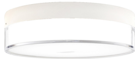
Shown in white / clear / white