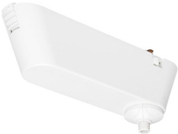
Shown in: White

T537QJLED G2 12 Volt LED Compatible Quick Jack Electronic Transformer is designed to accept Quick Jack fixtures and pendants. High impact polycarbonate housing available in White, Black or Silver finish. Ideally suited for use with low voltage LED fixtures. ETL listed. The low profile 12 volt, 60 watt electronic transformer features an on/off switch and two position power contact provided for two-circuit application. Compatible with 12 volt LED or halogen Quick Jack fixtures consuming up to 60 watts. Designed for use with Juno Lighting Trac-Lites, Trac-Master 1-circuit and Trac-Master 2-circuit 120 volt line voltage track systems.