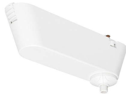
Shown in white

T537QJLED G2 12 Volt LED Compatible Quick Jack Electronic Transformer is designed to accept Quick Jack fixtures and pendants. High impact polycarbonate housing available in White, Black or Silver finish. Ideally suited for use with low voltage LED fixtures. ETL listed. The low profile 12 volt, 60 watt electronic transformer features an on/off switch and two position power contact provided for two-circuit application. Compatible with 12 volt LED or halogen Quick Jack fixtures consuming up to 60 watts. Designed for use with Juno Lighting Trac-Lites, Trac-Master 1-circuit and Trac-Master 2-circuit 120 volt line voltage track systems.