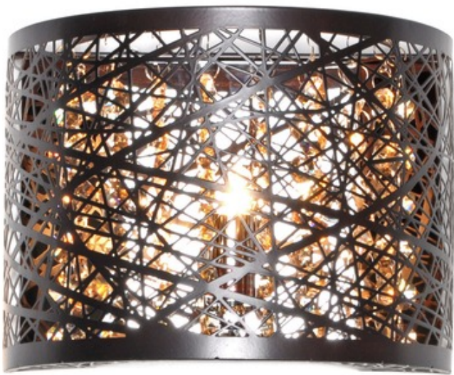
Shown in: Bronze

Legendary meets contemporary with the Inca Wall Light. Reminiscent of the mythical tales of Incan treasures, the fixtures offer brilliantly shining crystals enclosed within a precision laser-cut sheath that cannot be duplicated. The glow of the light from within casts a beautifully radiant shine that adorns the outer permeable layer. Note: Only LED included option is Title 24 (J8).