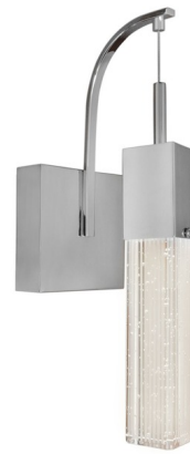
Shown in polished chrome / etched bubble

LAMP COLOR . . . . . 2900K LUMENS/WATT . . . . . 173.33 LUMINOUS FLUX . . . . . 1300 lumens