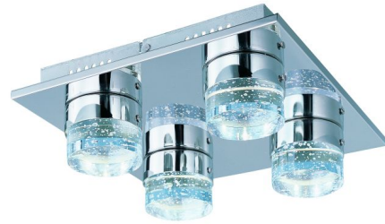
Shown in polished chrome / clear

Fizz IV Flush Mount features an etched bubble glass shade in a polished chrome finish. Four 7.5-watt, 120 volt LED lamps come included. Suitable for dry locations. Dimensions: 13W x 13H x 4L.