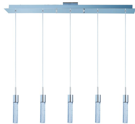
Shown in polished chrome / clear

PRODUCT DIMENSIONS . . . . . Min/Max Overall Height: 14" - 134" LAMP COLOR . . . . . 3300K LUMENS/WATT . . . . . 164.00 LUMINOUS FLUX . . . . . 1230 lumens